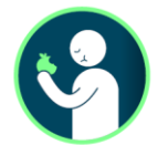
loss of, or change in, your normal sense of taste or smell (anosmia)

Tests must be booked through the national portal online at www.gov.uk/get-coronavirus-test or by phoning 119. Do not phone 111, turn up at a local test site without a booking, contact the GP or visit A&E, they will not be able to help. Just keep trying the national portal.