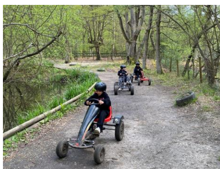
Winchester Science Museum